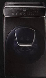
Samsung FlexWash 16kg washing machine in Stainless Black, $2799, Harvey Norman.