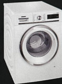
Siemens iQ800 9kg Washing Machine with sensoFresh, $1999, Winning Appliances.

Picking the right washing machine is key to keeping energy costs low and creating efficient workflows.